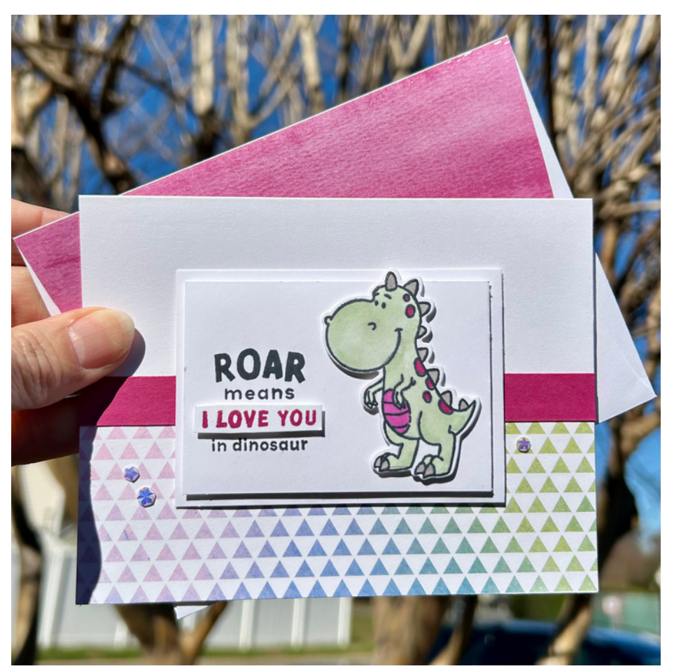
All images © Stampin' Up!